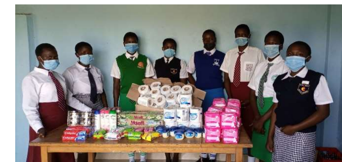
Julian's High School girls ready for school

Your gifts enabled EWI to help provide the supplies and toiletries the high school girls needed before returning to school and made it possible for the teachers to purchase books needed for the new syllabus.