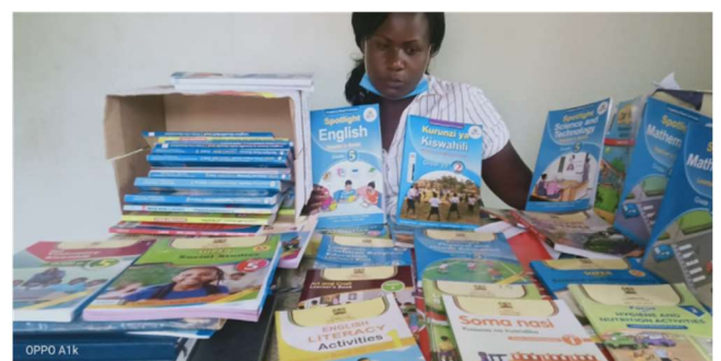
Los Angeles Bright Academy teacher with new books