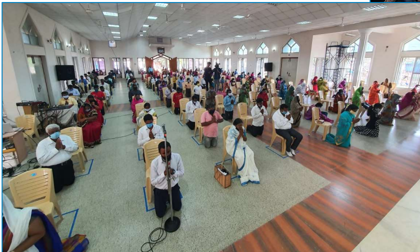
A small church gathering near the Jehovah Shammah Children's Home

Bethel Mission Church is known as 'The House of Prayer.'