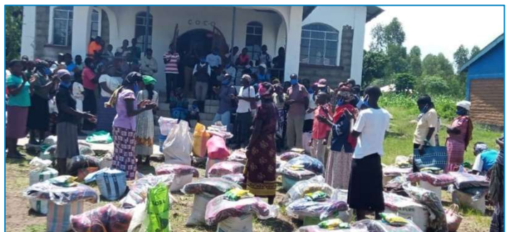
Those gathered at the Oduwo church to receive gifts of food and supplies joined in prayers of thanksgiving.