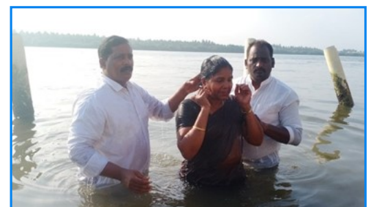
Above: One of five women baptized this day