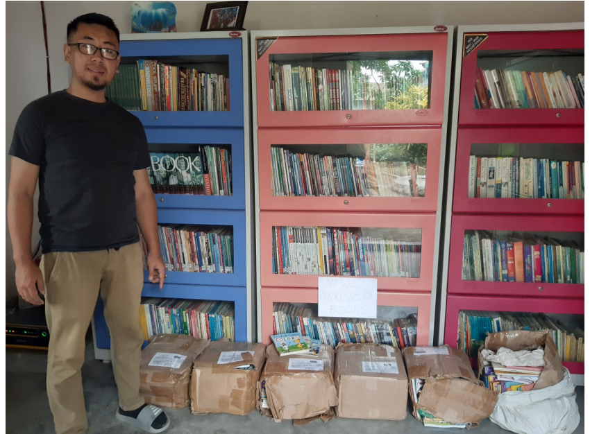
Boxes of books arrive at the Nagaland Children's Hope Library in India

One of our Bible school Partners in India had to suspend operations during the pandemic but is hoping to reopen soon. In addition to running the Bible school, the mission operates a child development center serving 150 children, has a primary school, and assists 35 pastors working in very remote areas. East West InterKnit will resume shipment of appropriate books as soon as we learn that they are ready to receive them.