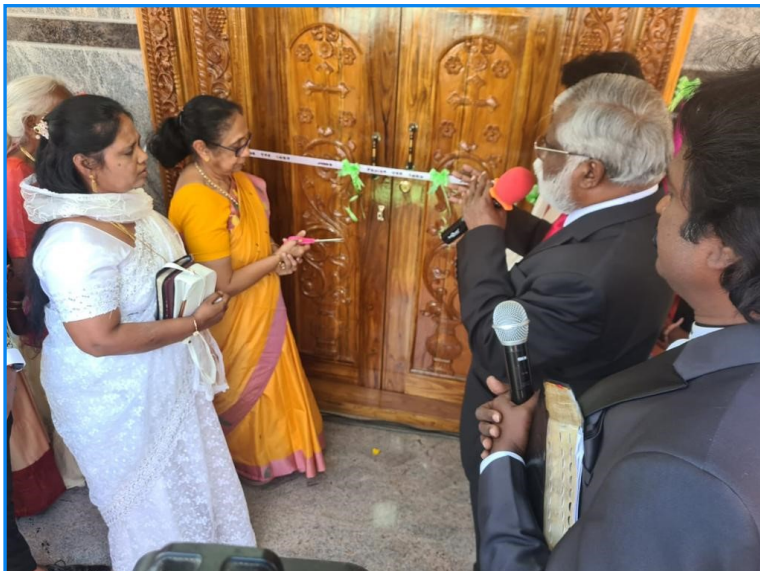
Dedicating the church

One of the pastors serving under this mission worked for years in a community resistant to the gospel before he was able to plant a church. Now the church has grown, and they have finally been able to construct a church building. Our partner and his associates had the privilege of traveling to the community and to participate in dedicating the new facility.